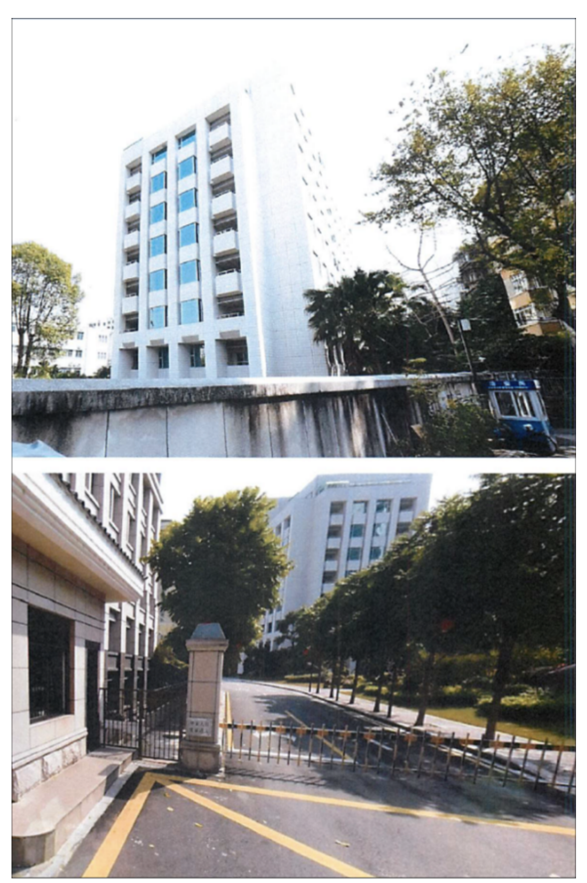
We decided to reach out to our network of contributors, asking about the GPIARC and any previous reference to this company or their known address. We received an interesting response from a trusted source who wishes to remain anonymous. This source, with