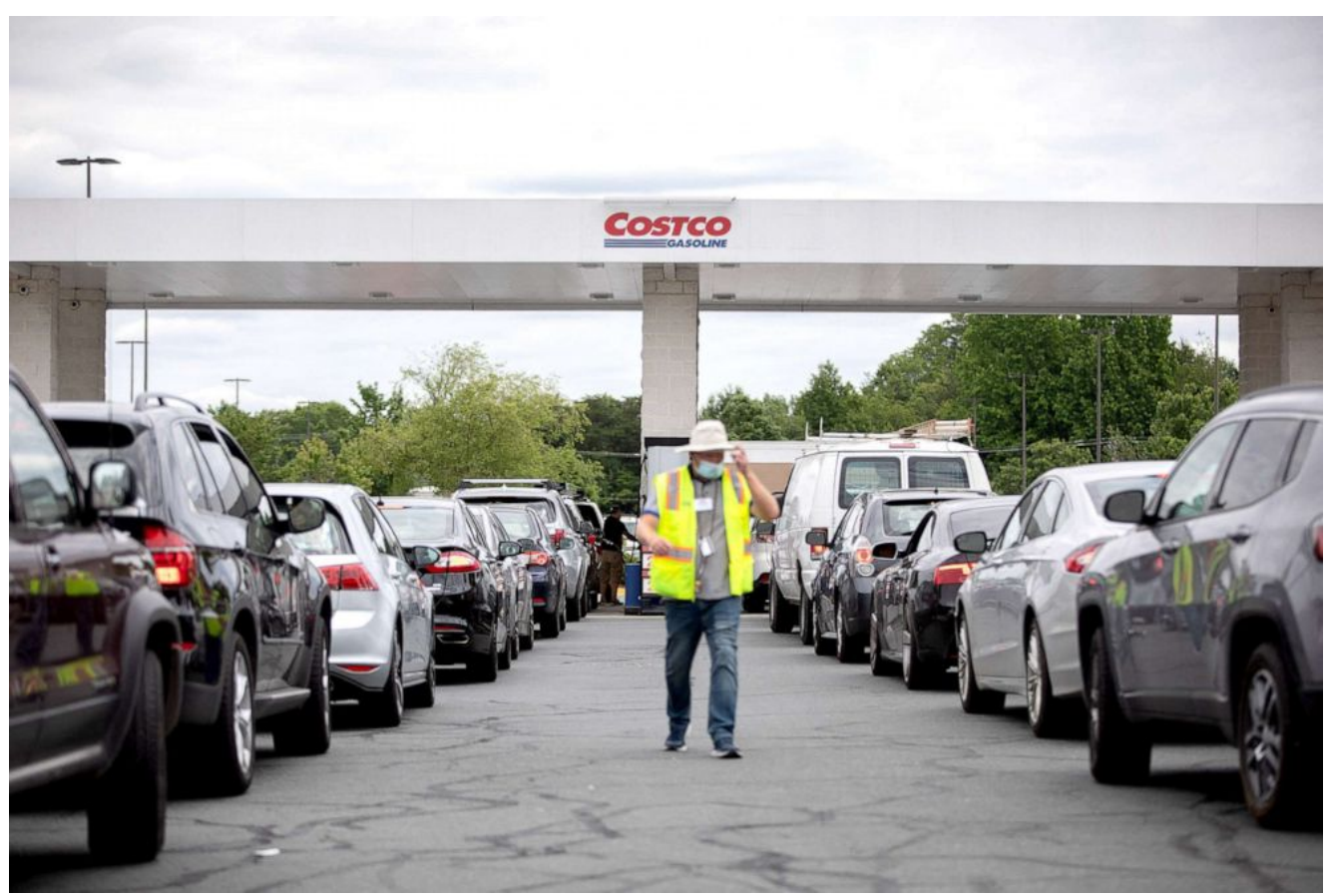
Attendants direct cars as they line up to fill their gas tanks at a COSTCO in Charlotte, N.C., May 11, 2021. Fears the shutdown of a major fuel pipeline would cause a gasoline shortage led to some panic buying in several locations.

In South Carolina, North Carolina, Virginia and Washington, D.C., gas stations with fuel outages are over 50%, according to <a href="mailto:GasBuddy">GasBuddy</a>.