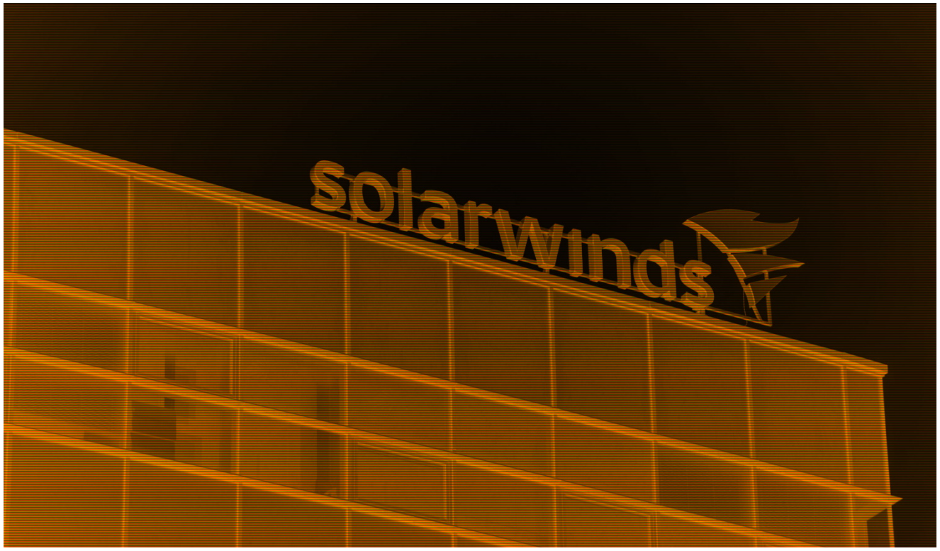
Texas-based software firm SolarWinds downgraded the number of customers impacted by its 2020 supply chain attack from 18,000 to less than 100.

In an <u>SEC filing</u> on Friday, the company said that based on new information surfaced during its investigation, such as DNS traffic records, it now believes that while 18,000 of its 300,000 customers downloaded a version of its Orion software that was tainted with the Sunburst malware, the attackers activated the malware only on a handful of customers networks.