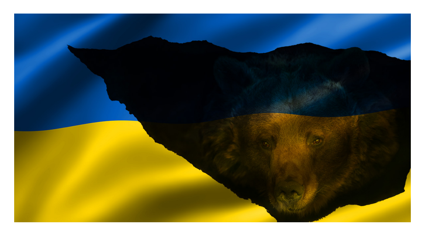
Research | April 19, 2021

anomali.com/blog/primitive-bear-gamaredon-targets-ukraine-with-timely-themes