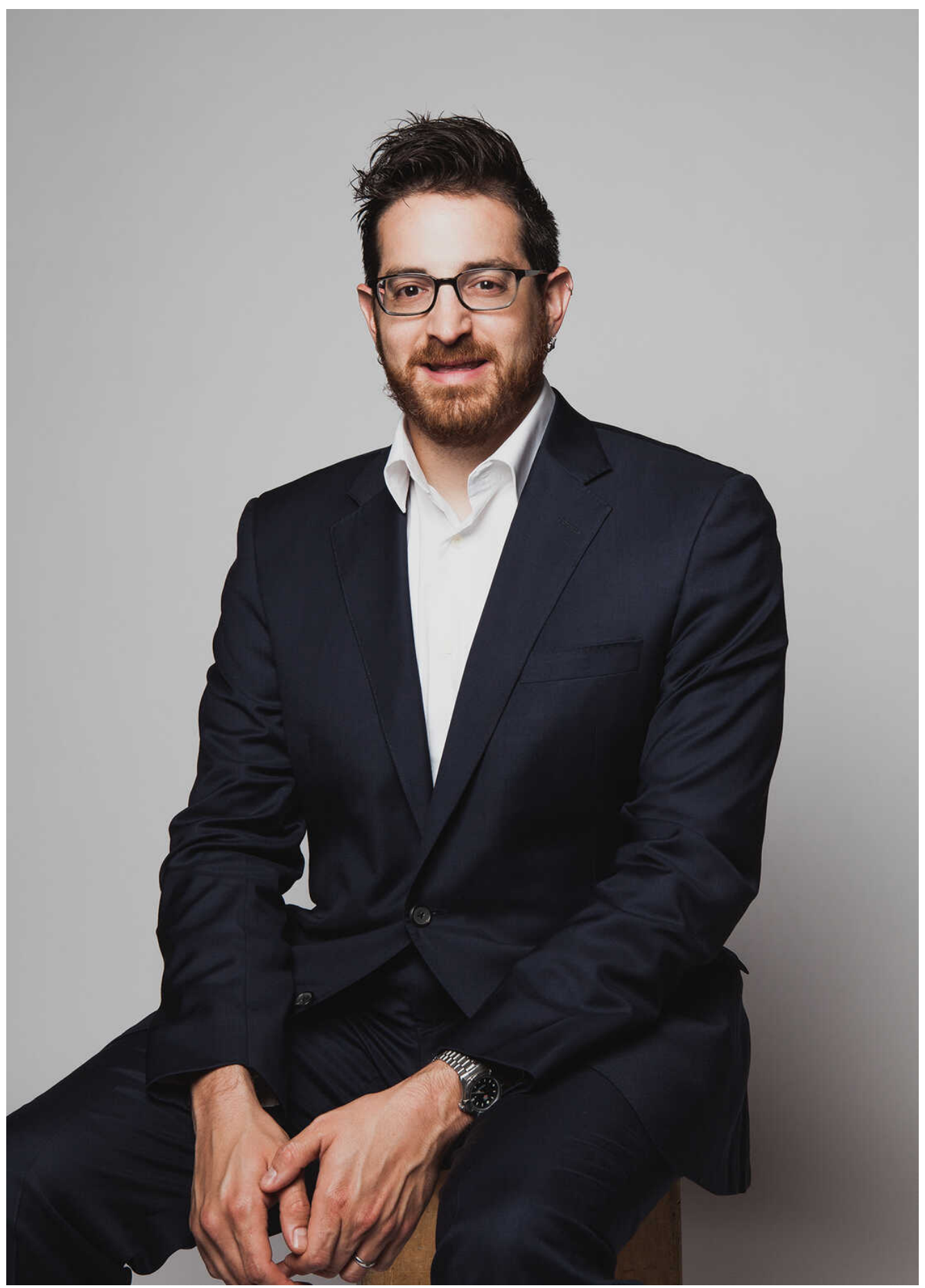
Enlarge this image