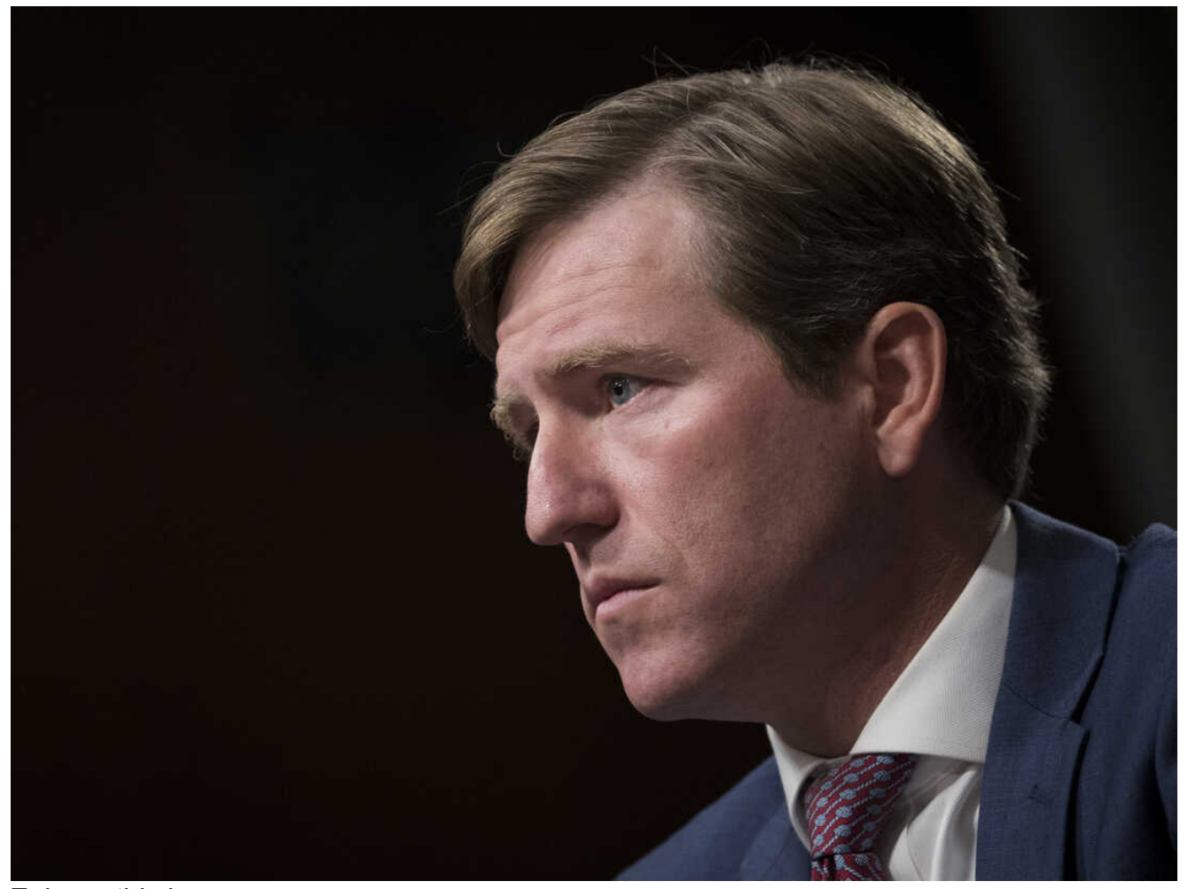
Enlarge this image