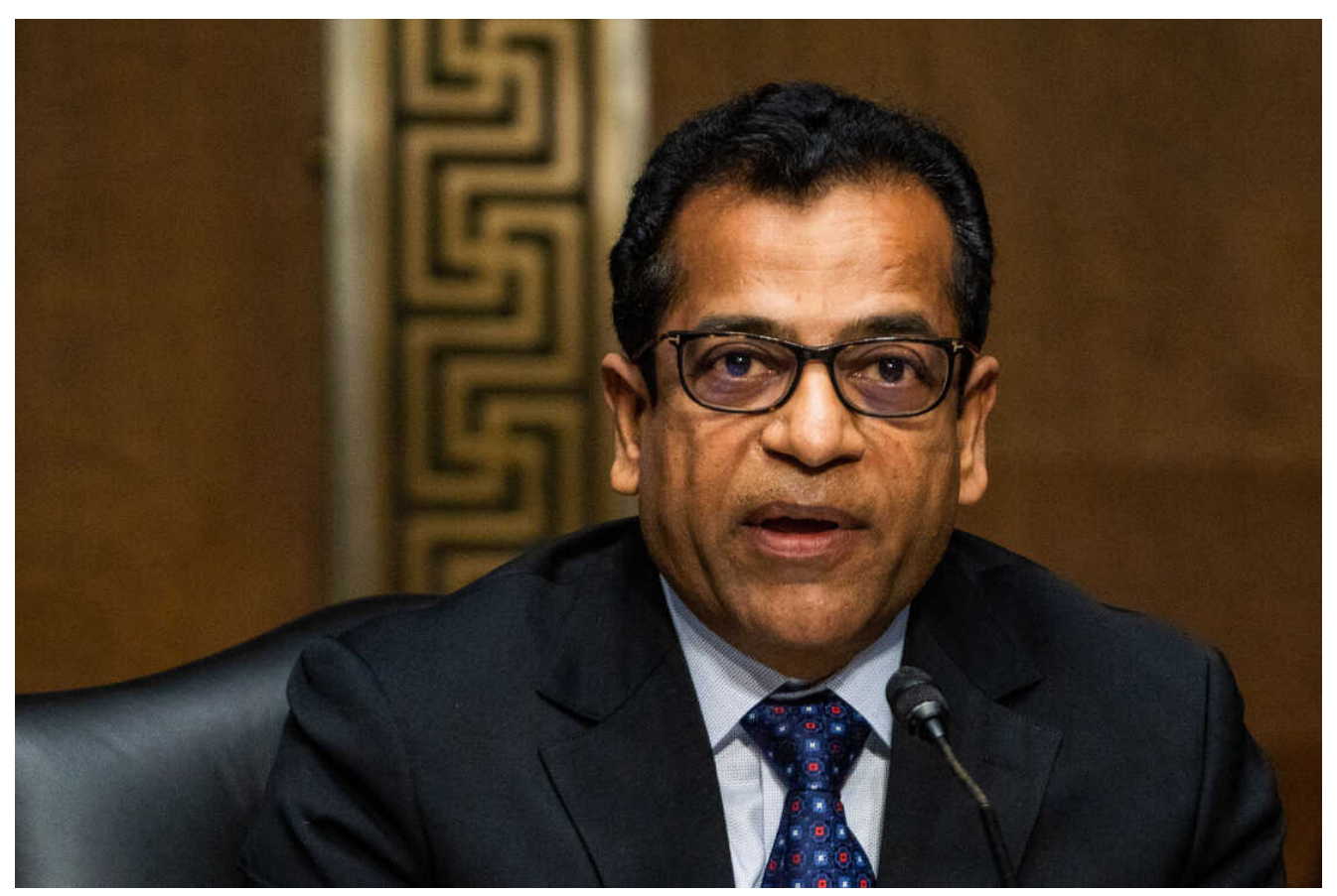
Enlarge this image

SolarWinds CEO and President Sudhakar Ramakrishna inherited the attack. He was hired shortly before the breach was discovered and stepped into the job just as the full extent of the hack became clear. hide caption