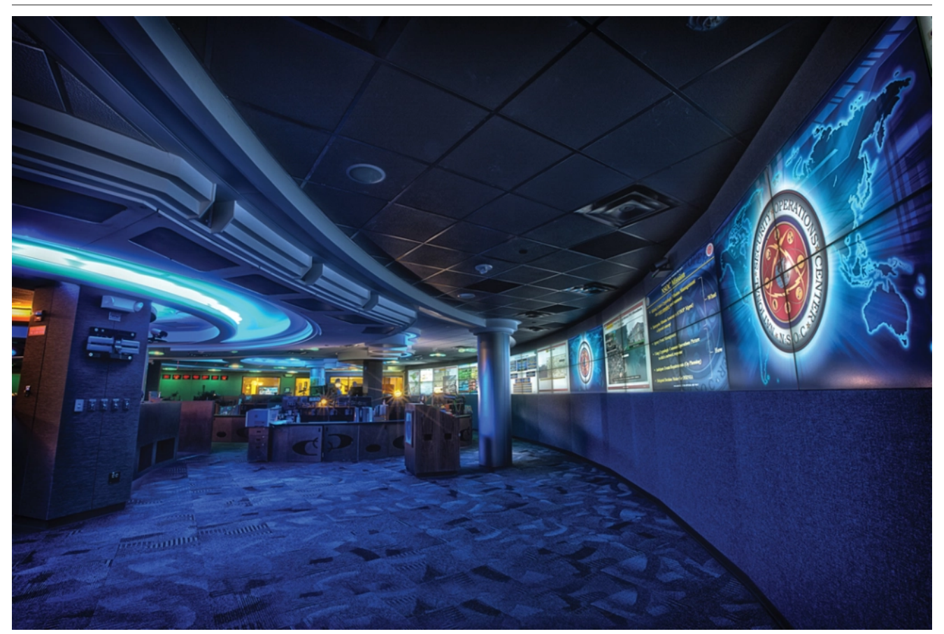
The NSA found a dangerous flaw in Windows and told Microsoft to fix it

The secretive security agency identified the vulnerability and is taking public credit as part of an effort to "build trust."