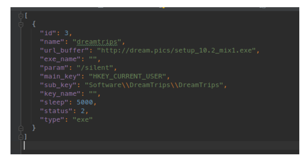
Figure 6: Decrypted download configuration served by the C2 server.