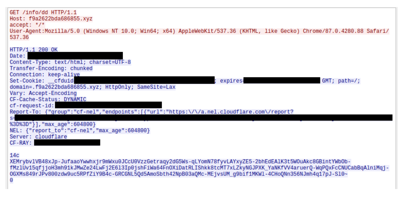
Figure 5: Encrypted download configuration returned from the C2 server.