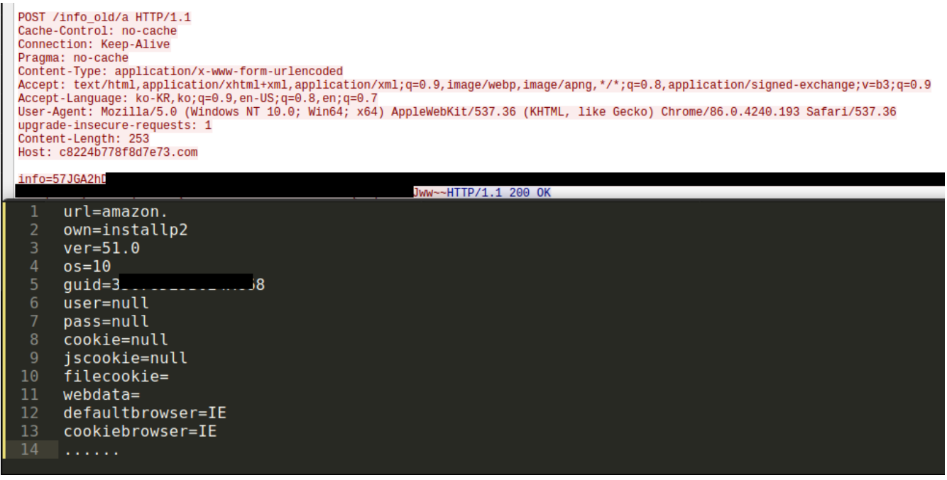
Figure 18: Amazon details exfiltrated to the C2 server.

Figure 17: The C2 server responding with a partial domain.