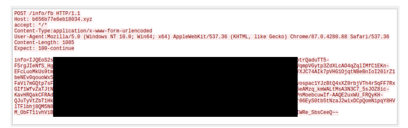
Figure 11: Facebook Data exfiltrated to the C2 server via "/info/fb"

CopperStealer sends the exfiltrated data to the C2 server via a POST request to a variety of target specific URIs (Figure 11). The data is stored withing the "info" key and is encrypted as described within the "C2 Traffic encryption" section of this report. The data exfiltrated contains target specific data fields (Figure 12).