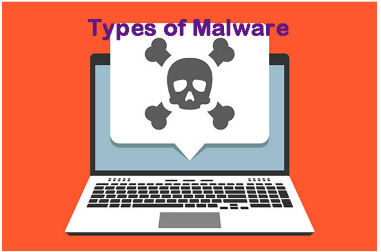
The Different Types of Malware and Useful Tips to Avoid Them

While, Version D counters pseudorandom domain names by generating daily a pool of 50 thousand domains across 110 TLDs, from which it randomly selects 500 to attempt for that day. The generated domain names were also shortened from 8 - 11 to 4 - 9 characters to make them more difficult to detect with heuristics.