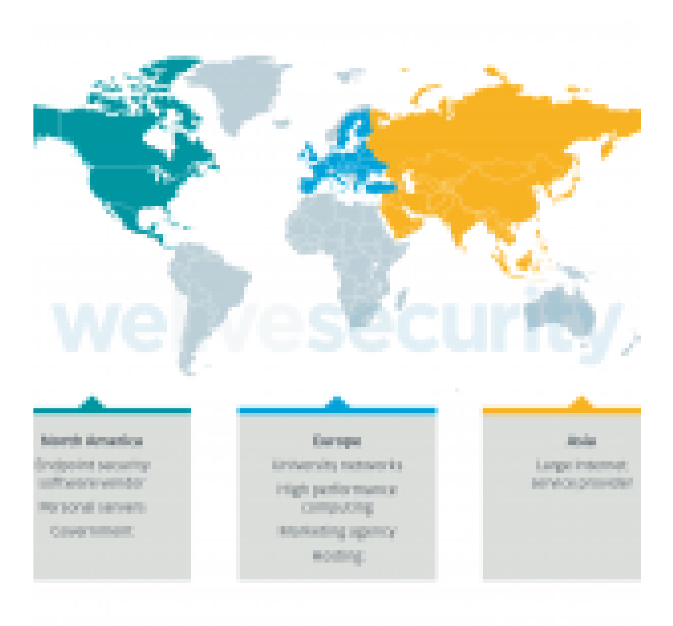
Figure 1. Industry and region of compromised organizations

We notified all identified victims and worked with them to remediate.