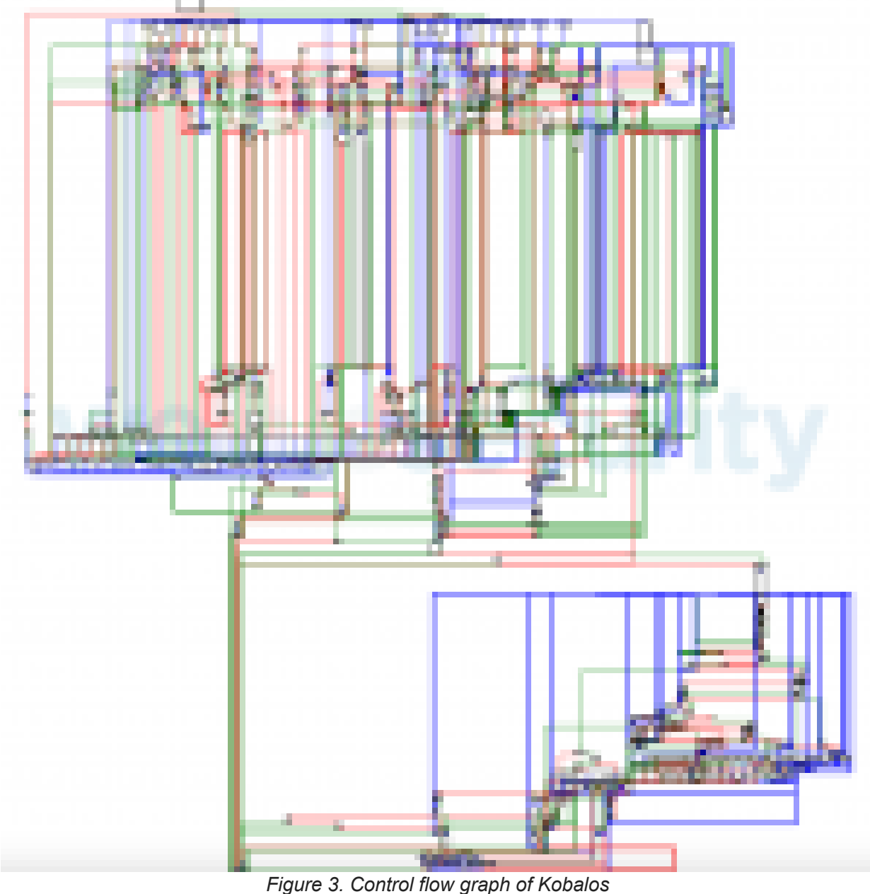
rigure 5. Control now graph of Robalos

This makes it more challenging to analyze. Additionally, all strings are encrypted so it's more difficult to find the malicious code than when looking at the samples statically.