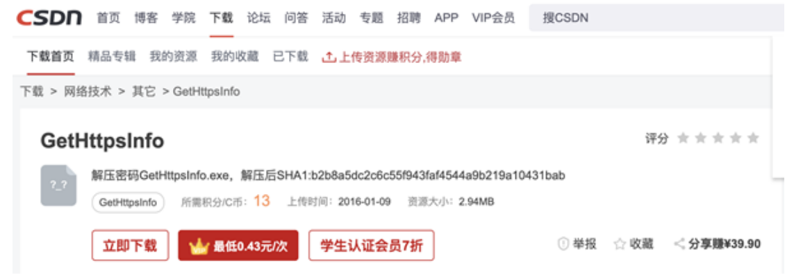
Figure 1: Example of a download location for GetHttpsInfo.exe