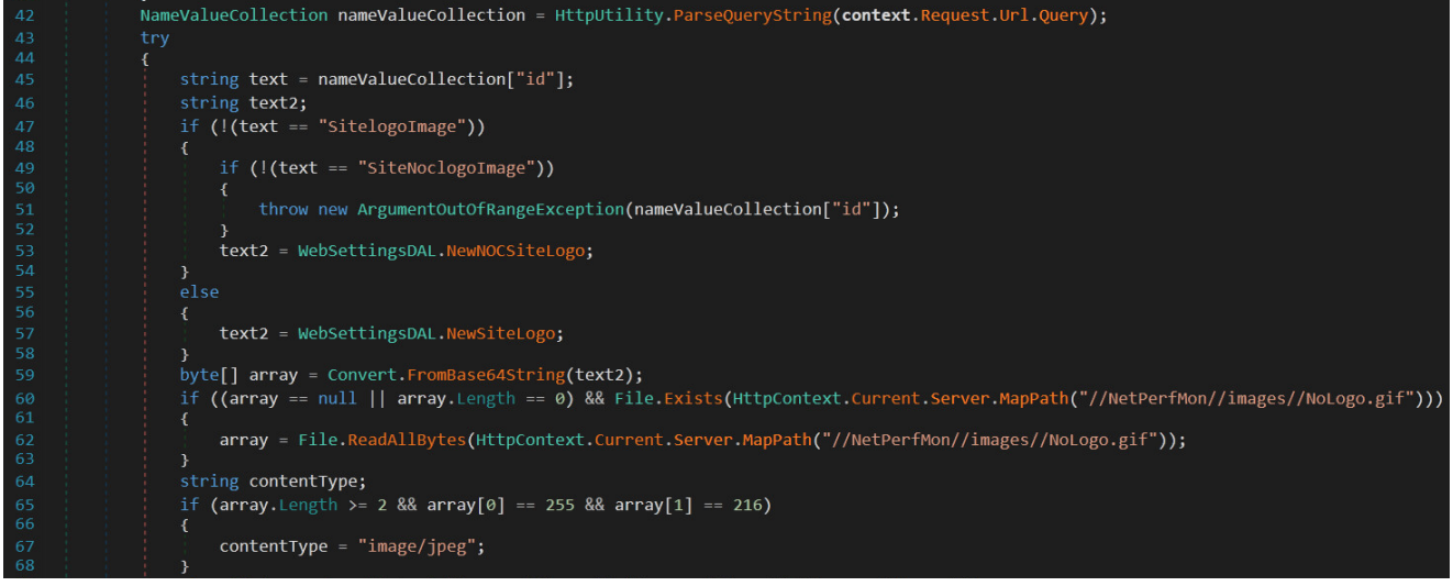
Figure 1. Benign SolarWinds code for handling the HTTP request and its response.

The attackers have leveraged the benign file by adding four new parameters to the API and a malicious method that executes the parameters in the context of the .NET runtime on the Orion host. Figure 1 below demonstrates the normal or benign content of the Orion component.