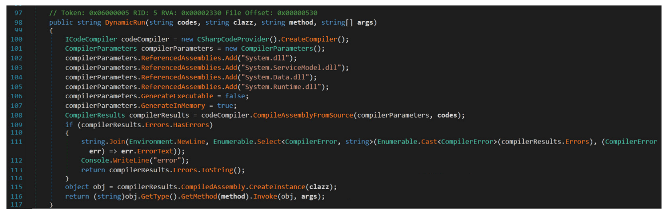
Figure 3. DynamicRun() compiles the C2 parameters into a .NET assembly in-memory. On lines 106 and 107, we can observe the innocuous compiler API flags that are subverted to impede defenders. Line 115 instantiates the class object specified by the attacker, and on line 116 the attacker code is executed.

The try/catch block beginning on line 27 that encompases the execution on line 37 has been added to presumably prevent operator error from causing an unhandled exception in Orion, which could trigger unwanted scrutiny. This is one small example of the attention paid by the actors to technical and operational security.