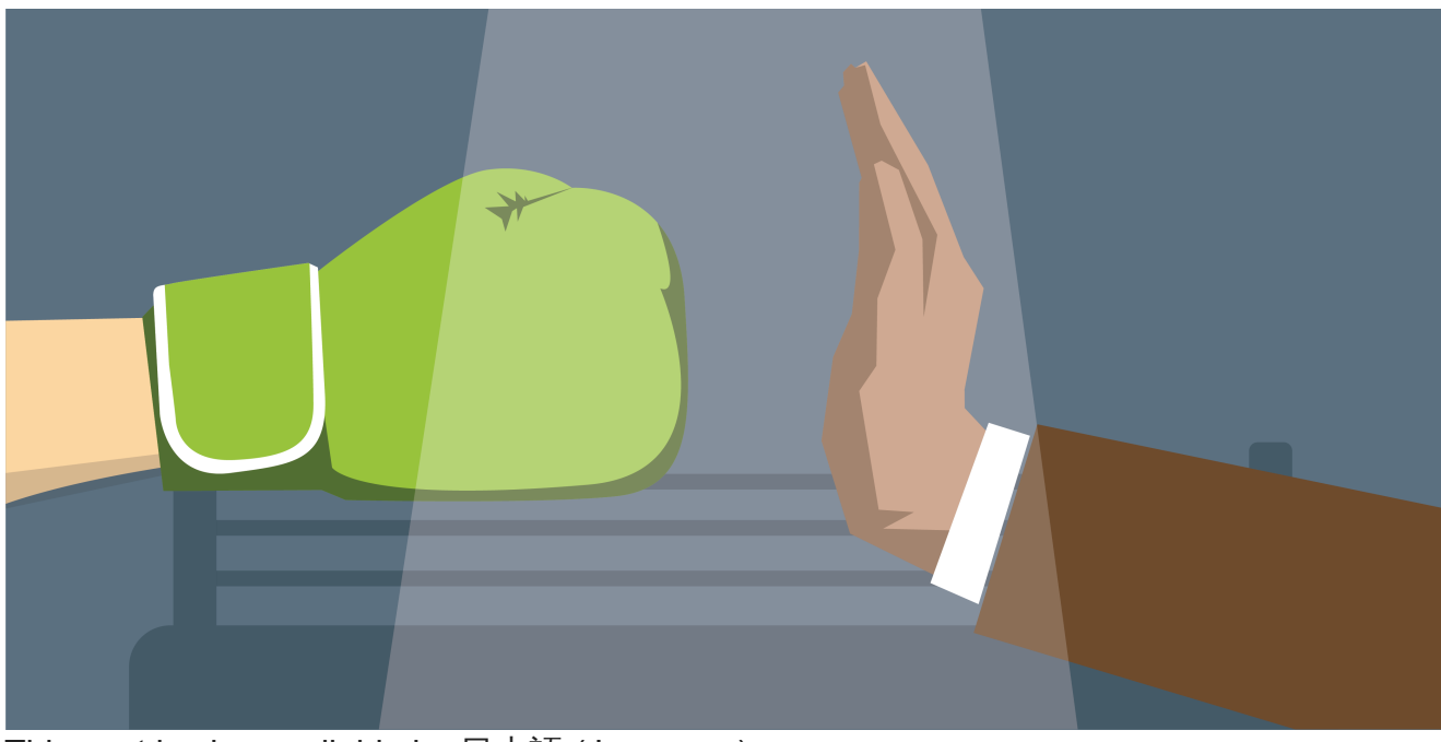
This post is also available in: <u>日本語 (Japanese)</u>