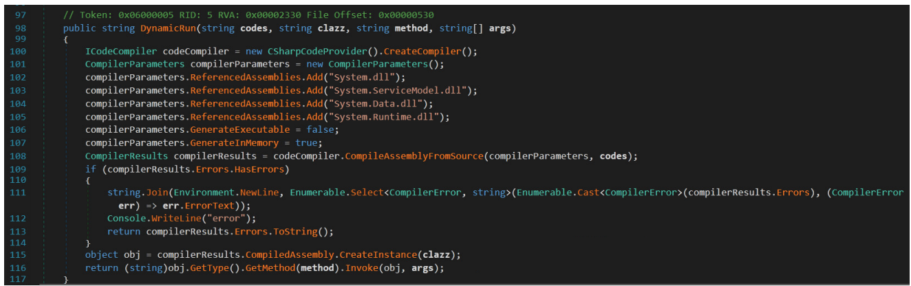
Figure 3. DynamicRun() compiles the C2 parameters into a .NET assembly in-memory. On lines 106 and 107, we can observe the innocuous compiler API flags that are subverted to impede defenders. Line 115 instantiates the class object specified by the attacker, and on line 116 the attacker code is executed.

The try/catch block beginning on line 27 that encompases the execution on line 37 has been added to presumably prevent operator error from causing an unhandled exception in Orion, which could trigger unwanted scrutiny. This is one small example of the attention paid by the actors to technical and operational security.