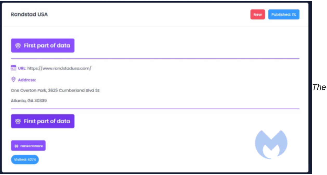
listing on the Egregor site confirms the attack

"We believe the incident started with a phishing email that initiated malicious software to be installed," a Randstad spokesperson said in an email.