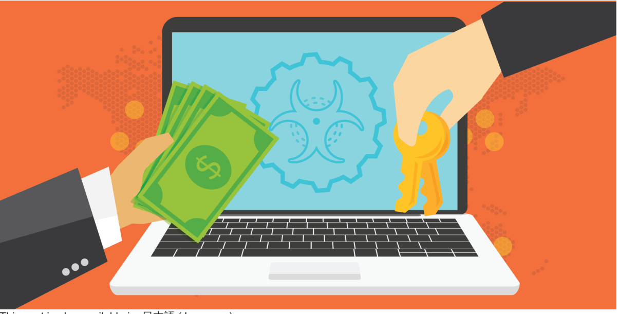
This post is also available in: 日本語 (Japanese)

Tags: <u>Defray777</u>, <u>PyXie</u>, <u>Vatet</u>