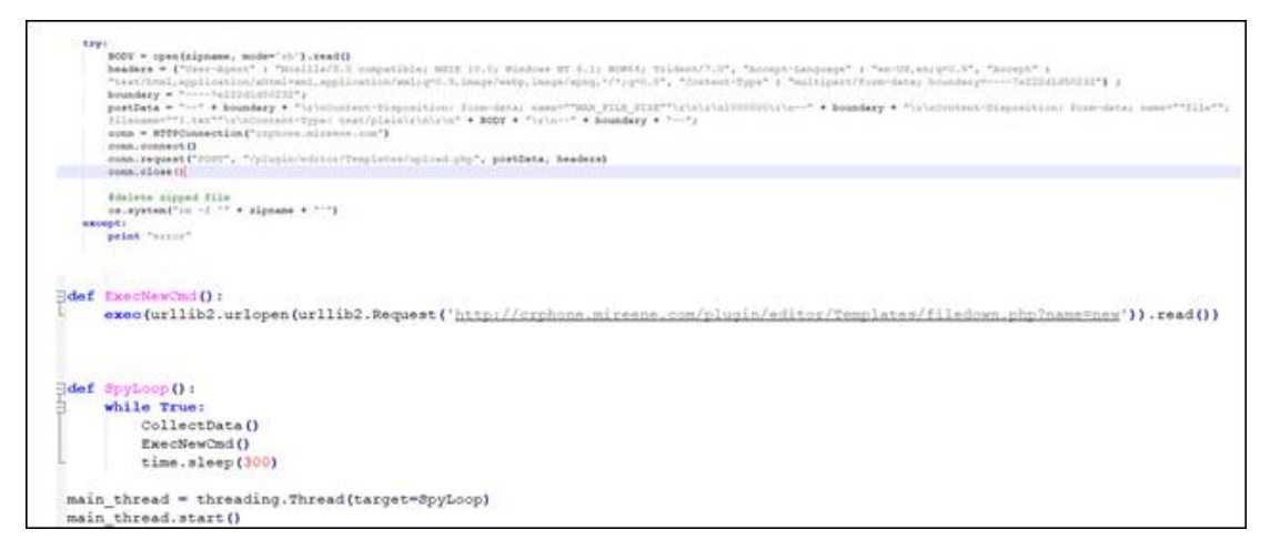
Figure 4: Python Script targeting MacOS [57]