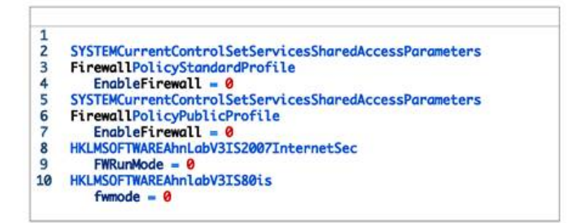
Figure 2: Disabled firewall values in the Registry [41]

Kimsuky's malicious DLL runs at startup to zero (i.e., turn off) the Windows firewall Registry keys (see figure 2). This disables the Windows system firewall and turns off the Windows Security Center service, which prevents the service from alerting the user about the disabled firewall (see figure 2) ( Impair Defenses: Disable or Modify System Firewall [T1562.004]).[40]