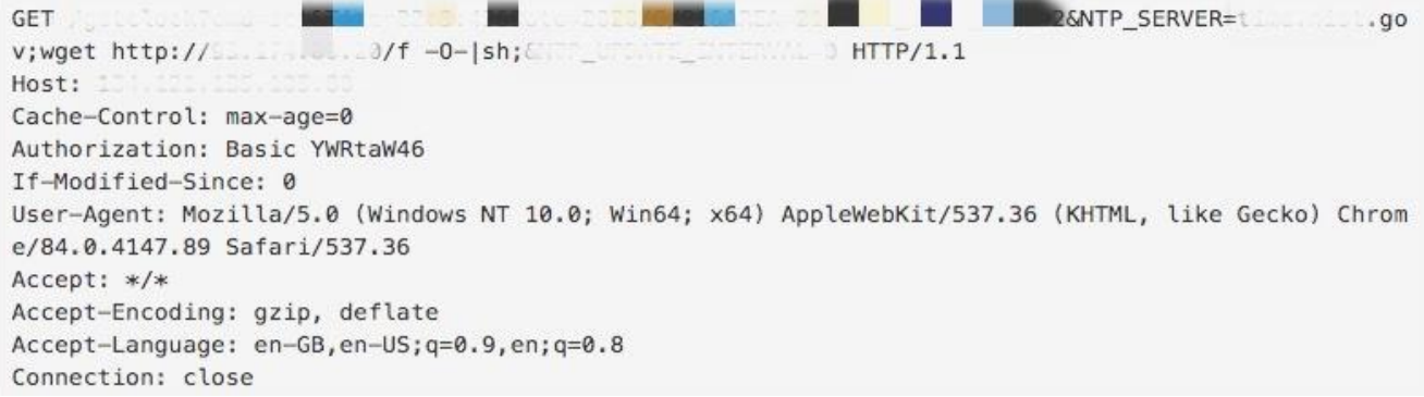
Figure 1. Command injection exploit over the wire

The first exploit, shown in Figure 1, targets a command injection vulnerability in a web service with an NTP server setting feature. The service fails to sanitize the value of the HTTP parameter NTP_SERVER, which in turn leads to arbitrary command execution.