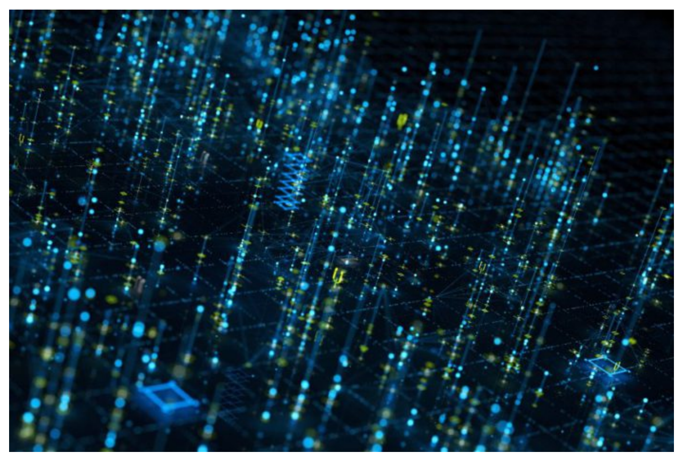
Services not available everywhere. ©2022 Lumen Technologies. All Rights Reserved.