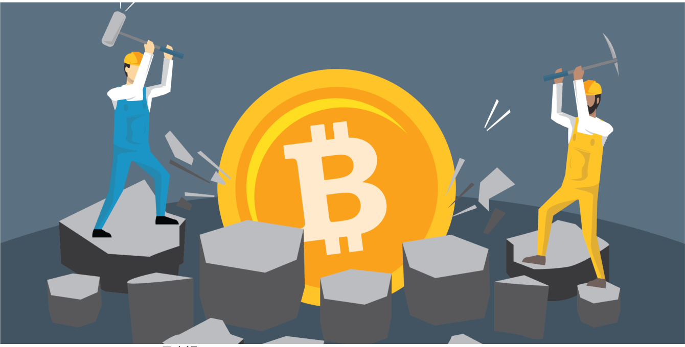
This post is also available in: 日本語 (Japanese)

Tags: cetus, Cryptocurrency, cryptojacking, Docker, Docker Daemon, Docker vulnerability, Worm