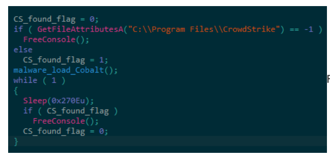
Figure 1: Decompilation showing CrowdStrike specific detection logic

An interesting behaviour can be spotted in the CobaltStrike payloads that are delivered from the second type of PowerShell scripts. In these, the loader has been modified with the purpose of detecting CrowdStrike software ( Figure 1 ). If the C:\\Program Files\\CrowdStrike directory exists, then the ' FreeConsole ' Windows API is called after loading the CobaltStrike payload. Otherwise, the 'FreeConsole' function is called before loading the CobaltStrike beacon. It is assumed that this is an attempt to bypass CrowdStrike's endpoint solution, although it still unclear if this is the case.