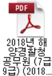
Figure 8. Malware disguised as PDF

The dropper executable installs Bisonal and a decoy file in the paths shown in Table 3, below.