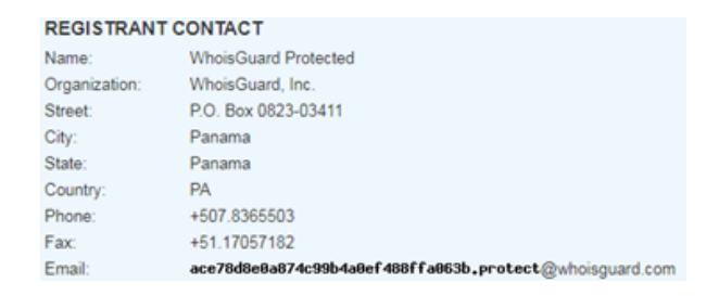
Figure 12. WHOIS information

The WHOIS information of the C&C domains used now uses domain privacy to conceal the registrant's contact information.