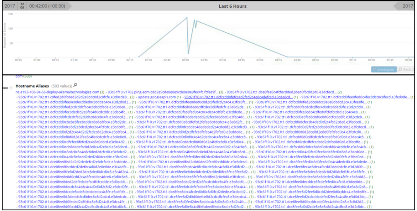
Figure 9 GratefulPOS exfiltrates credit card numbers as observed with NetWitness

Compared to the sample analyzed by Mr. Mendieta of Anomali in 2015, we observed only minor code changes. Instead of the particular campaign specified by "grp" strings, we see "v1702" is the campaign identifier, as displayed in an exfiltration packet (Figure 10).