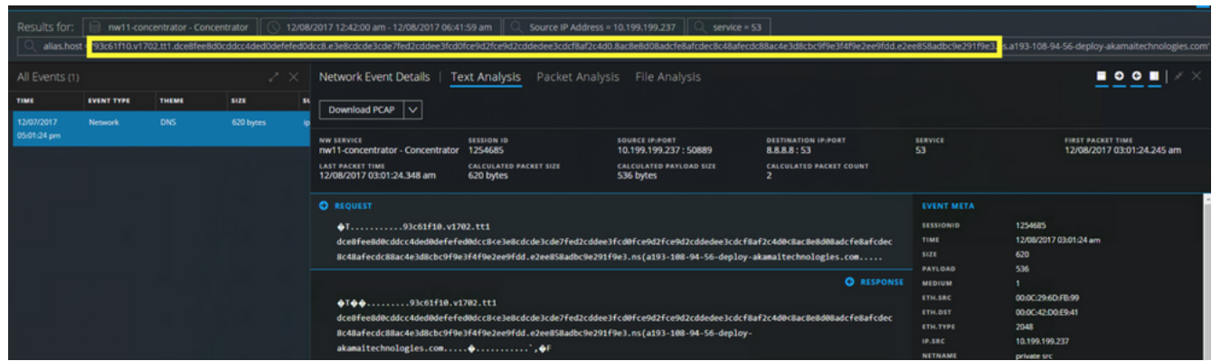
Figure 10 Encoded Track 1 data with campaign identifier "v1702" as observed in NetWitness 11 event analysis

Compared to the sample analyzed by Mr. Mendieta of Anomali in 2015, we observed only minor code changes. Instead of the particular campaign specified by "grp" strings, we see "v1702" is the campaign identifier, as displayed in an exfiltration packet (Figure 10).