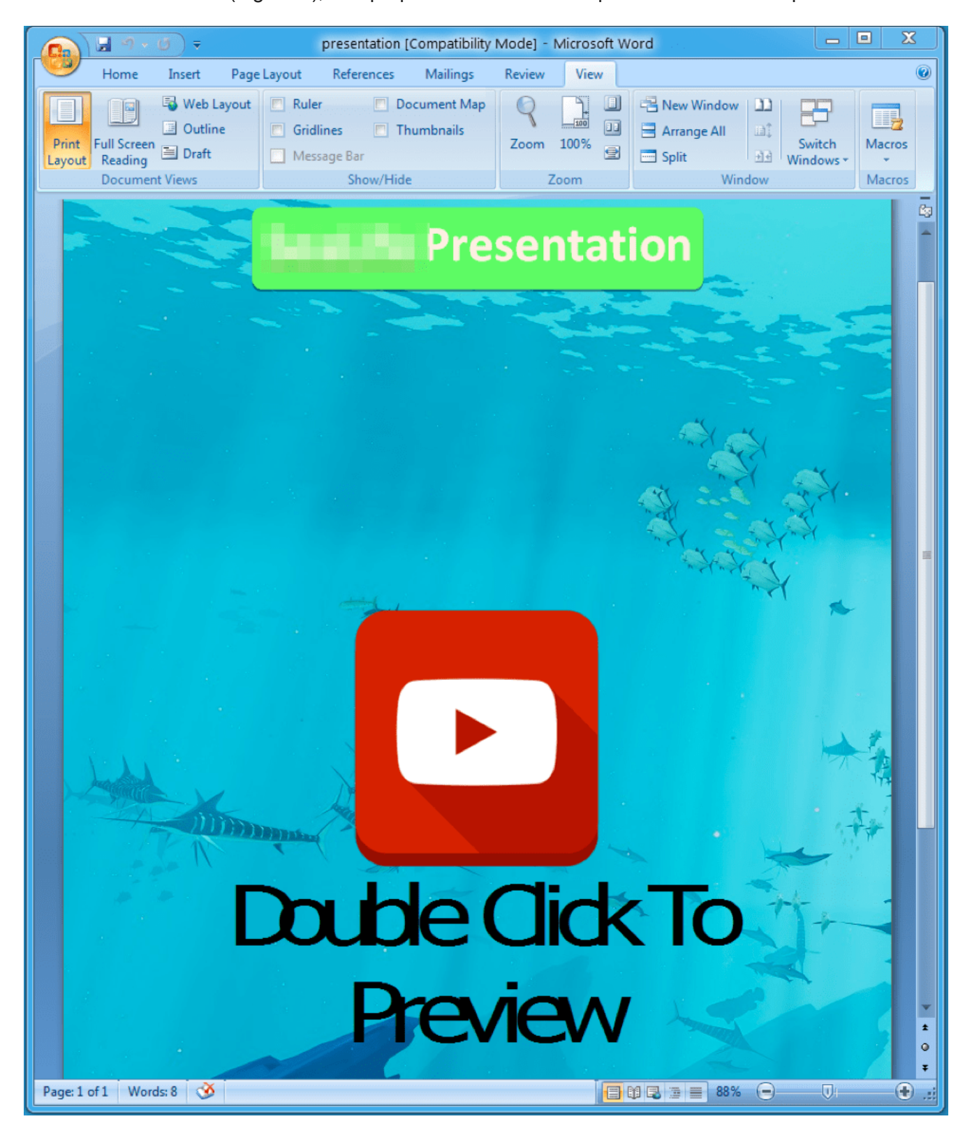
Figure 2: Word document attachment, presentation.doc, delivered in malicious email messages

In the August 15 campaign, the attachment used a lure referencing a UK-based aquarium with international locations (Figure 2), and purported to be from a representative of the aquarium.