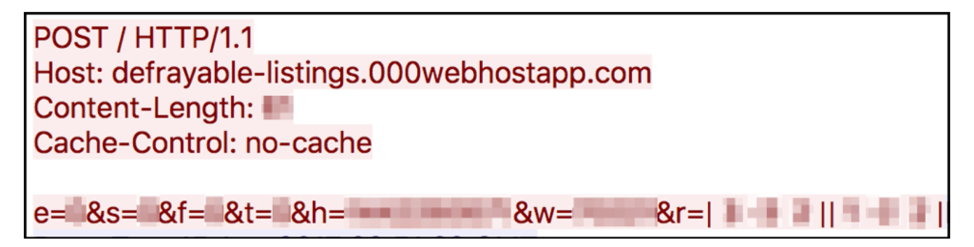
Figure 4: Screenshot of the clear-text C&C beacon

Defray has been observed communicating with an external C&C server via both HTTP (clear-text, shown in Figure 4) and HTTPS, to which it will report infection information.