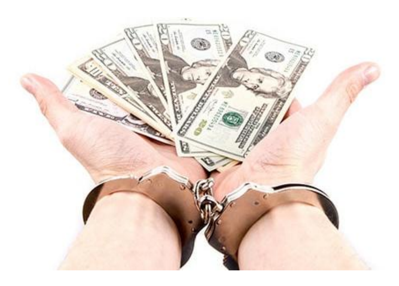
August 24, 2017 Proofpoint Staff