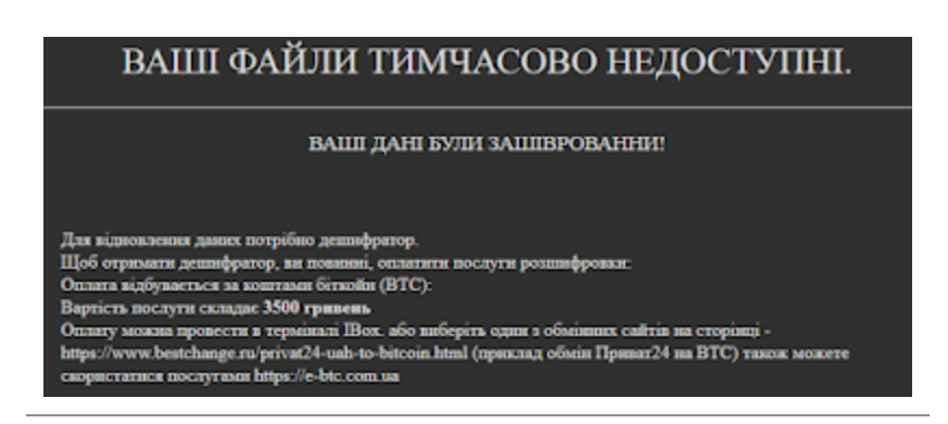
Figure 3 - PSCrypt ransom message

PSCrypt will encrypt files and append an extension of .pscrypt - in order to restore your files, which asks for 3500 Hryvnia (~ EUR 115):