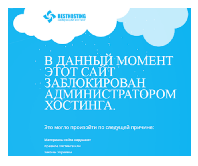
Figure 1 - "At this moment the site is blocked by the hosting administrator"

From the archived webpage, it becomes apparent they provide accounting software, peronalisation of medical records, blood service and "full automation of the doctor's office" - contrary to what their company name suggests, it appears they are (mostly) focused on medical software.