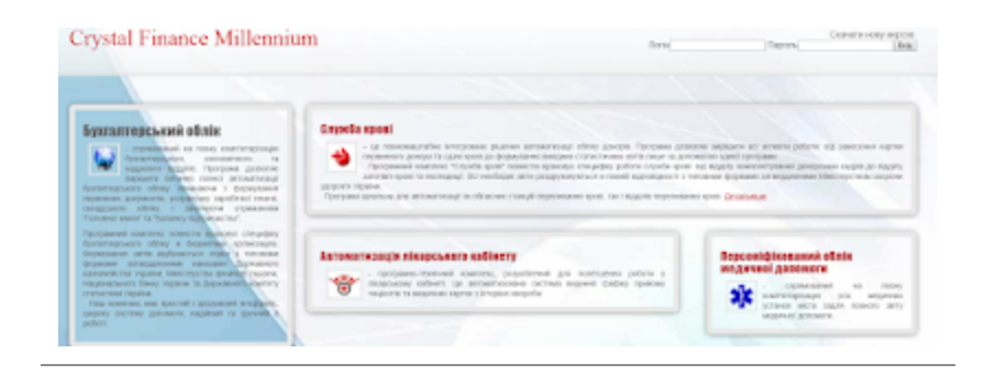
Figure 2 - archived webpage of CFM's services

From the archived webpage, it becomes apparent they provide accounting software, peronalisation of medical records, blood service and "full automation of the doctor's office" - contrary to what their company name suggests, it appears they are (mostly) focused on medical software.