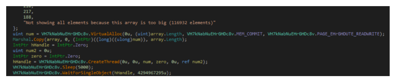
Figure 1 - The main code from the .NET wrapper, with the Shellcode array being created and executed in a new thread.

The main payload is delivered in a Microsoft .NET Framework file within previously mentioned MSI file. When executed, the .NET Framework wrapper will first check if VMware tools is running in background, this is done via a simple process check, searching for any process named "vmtoolsd." Provided there are no matching processes running, the malware continues execution, creating a registry entry with the name 'MSASCuiLTasks' in HKCU\Software\Microsoft\Windows\CurrentVersion\RunOnce for persistence. This registry key causes the malware to run again each time the system reboots. Next, it will copy the first stage shellcode in memory and create a new thread with the shellcode running in it, the code responsible for this execution is shown in Figure 1. The shellcode is not encrypted but is obfuscated.