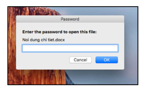
Figure 2. Decoy document prompts for a password to open the file

Once the application bundle is launched, it opens a hidden file in the bundle's Resources folder named .CFUserEncoding which is a password-protected Word document (see Figure 2). It also copies this file to the executable path and essentially replaces the application bundle after persistence has been set up. This would lead the victim to believe that nothing was amiss, as they thought they were opening a Word document and a Word document opened. In this case, the Word file has the name "Noi dung chi tiet.docx", which is Vietnamese for "Details."