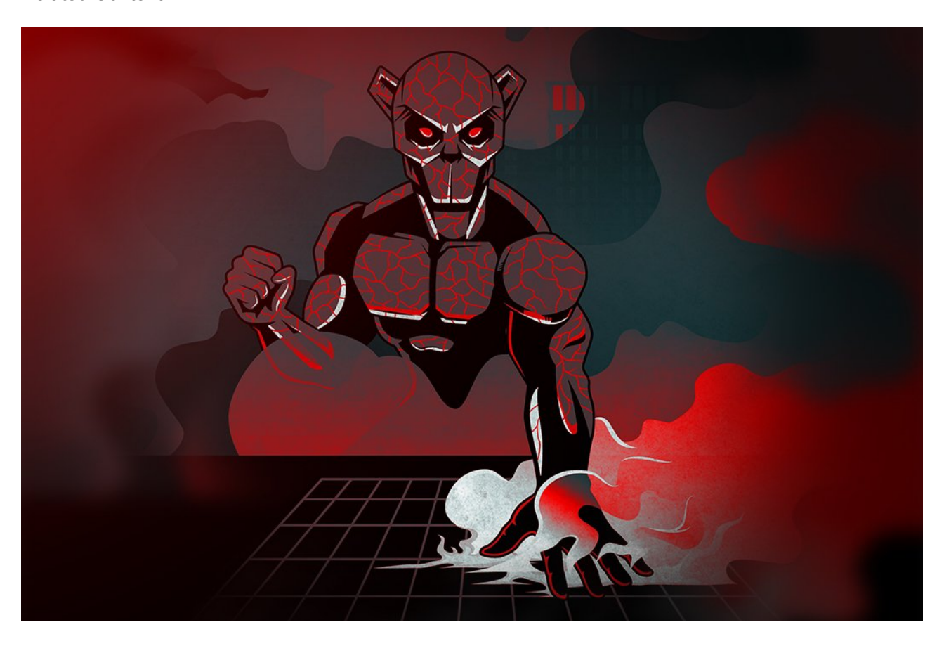
Who is EMBER BEAR?