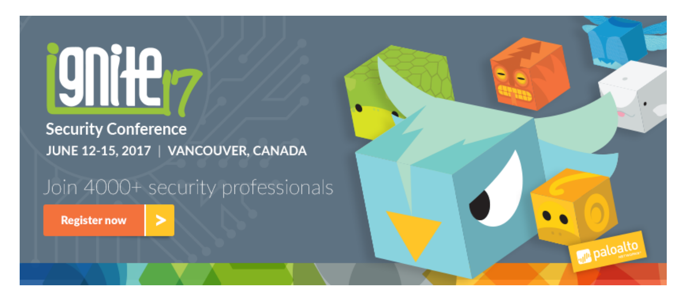
Ignite '17 Security Conference: Vancouver, BC June 12–15, 2017

Ignite '17 Security Conference is a live, four-day conference designed for today's security professionals. Hear from innovators and experts, gain real-world skills through hands-on sessions and interactive workshops, and find out how breach prevention is changing the