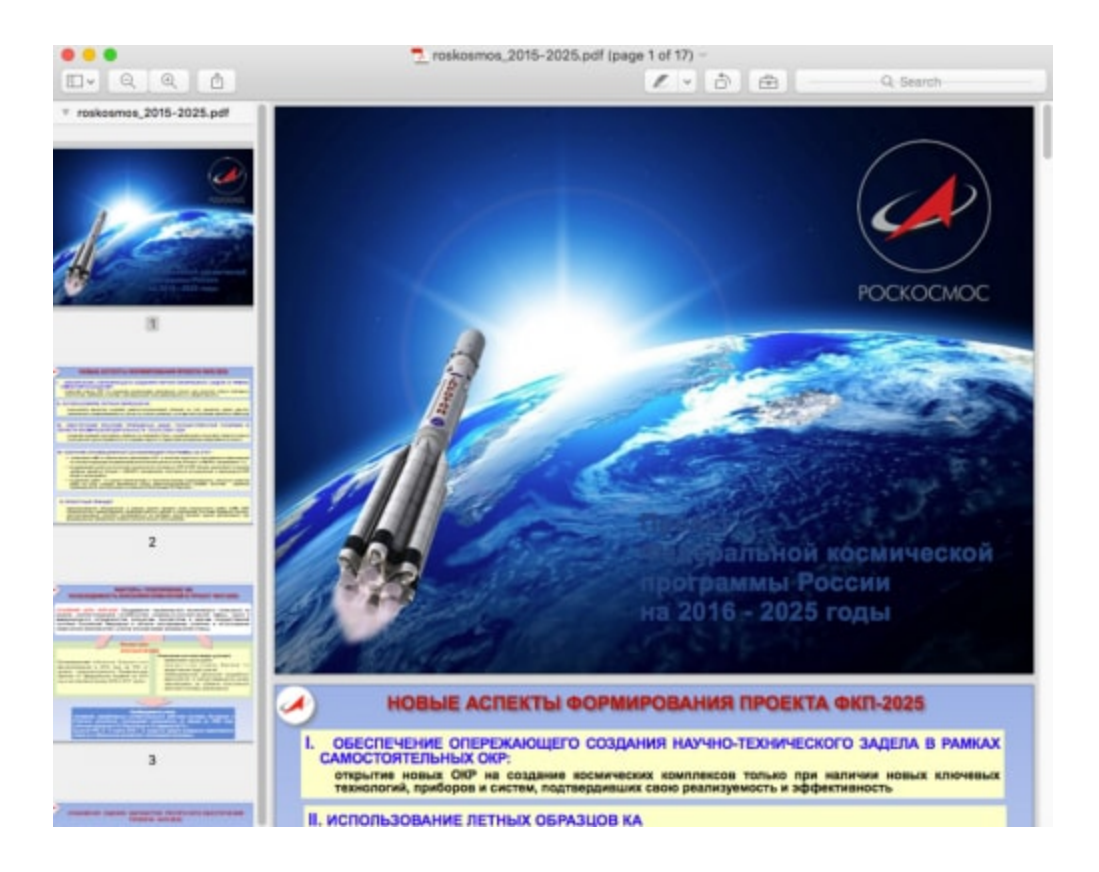
Figure 2 Decoy document opened by Komplex binder showing document regarding the Russian Space Program