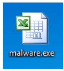
Figure 1 Microsoft Excel icon used by Aveo malware

The Aveo malware sample disguises itself as a Microsoft Excel document, as the icon below demonstrates. Note that the filename of 'malware.exe' is simply a placeholder, as the original filename is unknown.