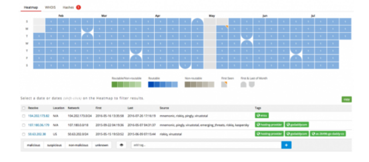
Figure 3 PassiveTotal screenshot showing associated IP addresses with snoozetime[.]info

All IP addresses in question are located within the United States.