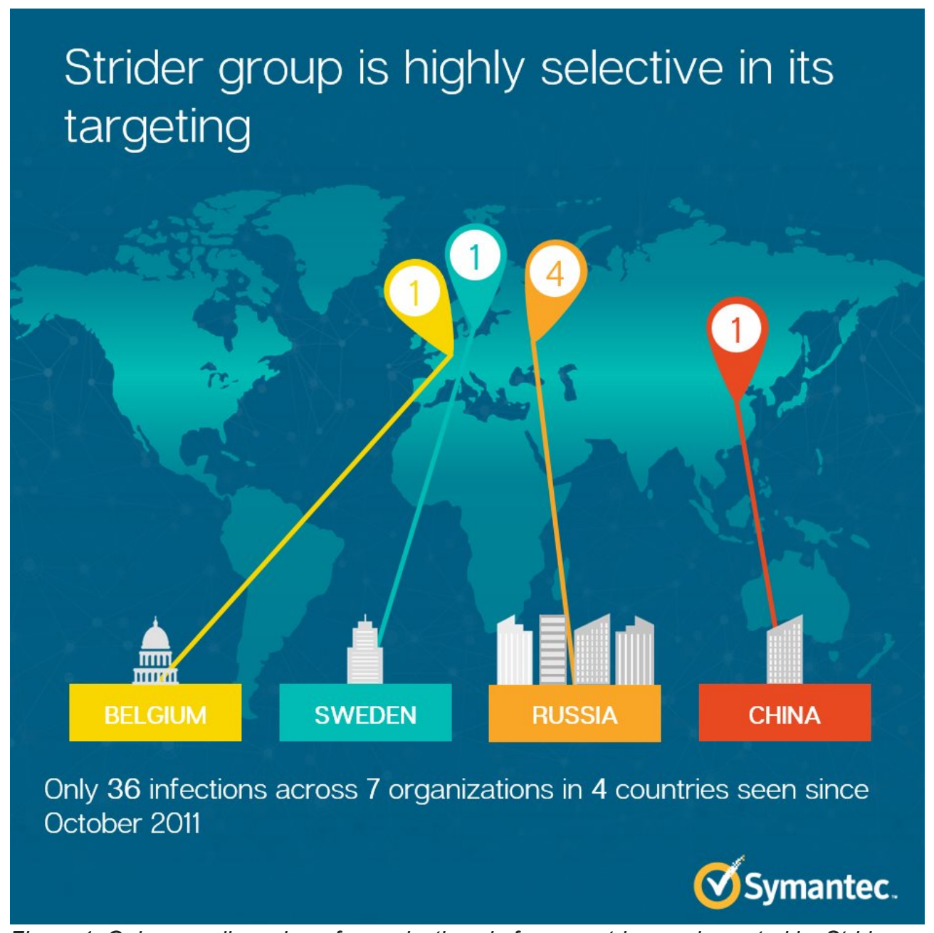
Figure 1. Only a small number of organizations in four countries are impacted by Strider

Strider has been highly selective in its choice of targets and, to date, Symantec has found evidence of infections in 36 computers across seven separate organizations. The group's targets include a number of organizations and individuals located in Russia, an airline in China, an organization in Sweden, and an embassy in Belgium.