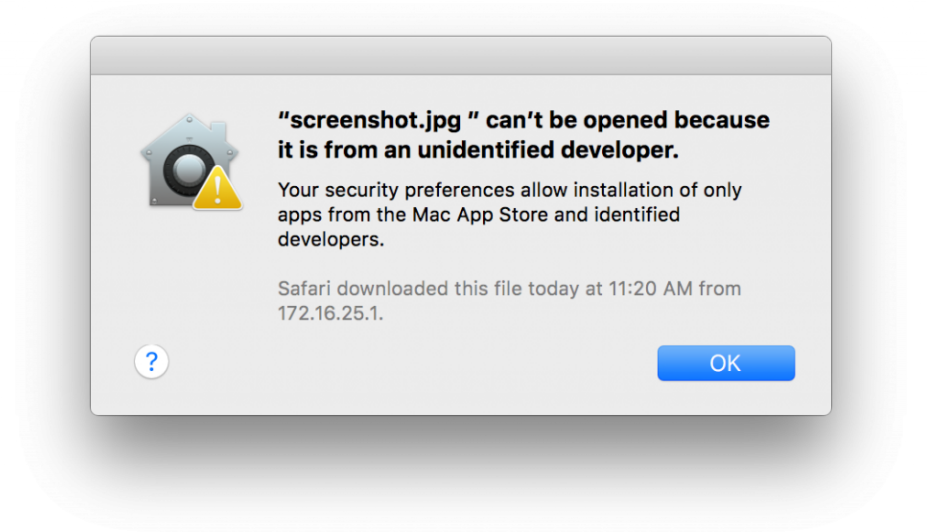
Figure 4: Message shown if ZIP file is downloaded from Safari

The downloader is an unsigned Mach-O executable. Thus, if the file is downloaded from an internet browser and Gatekeeper is activated on the machine – the default in recent versions of OS X and macOS – it will not execute and display a warning to the user.