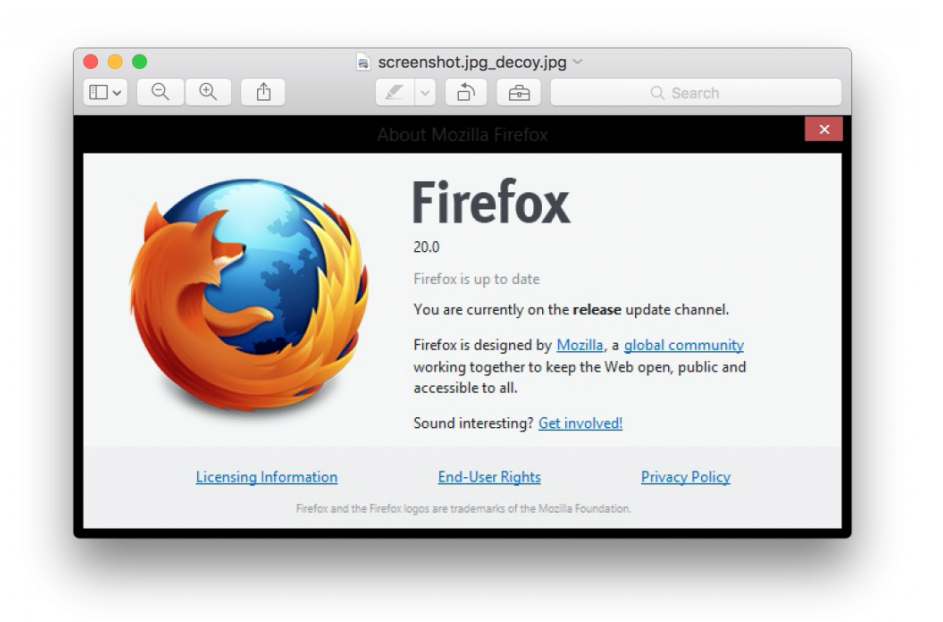
Figure 5: Example decoy image (3)