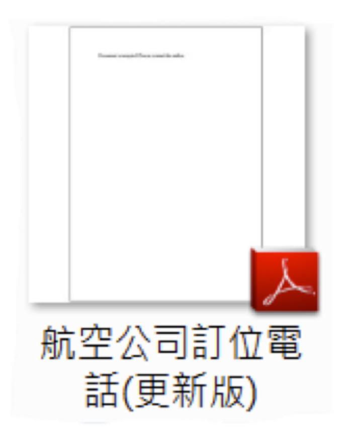
Figure 7 PDF named "Airline Reservation Number"