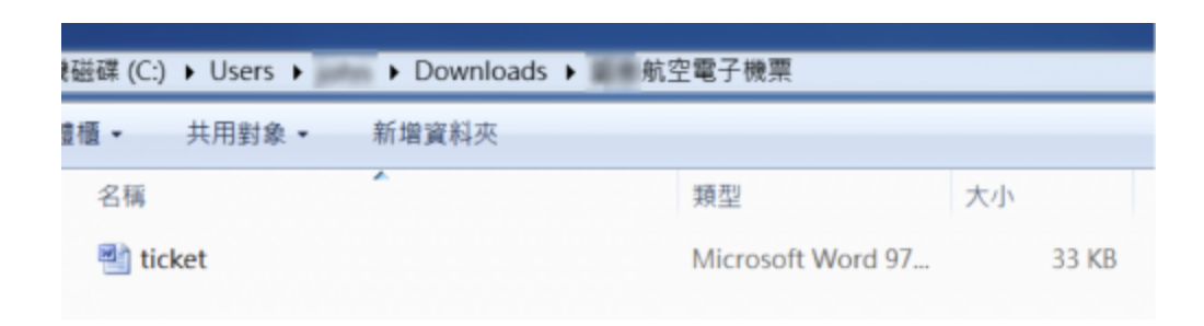
Figure 6 doc file created by Elirks

When opening the file, Elirks executes itself on the computer and creates ticket.doc to deceive users (Figure 6).