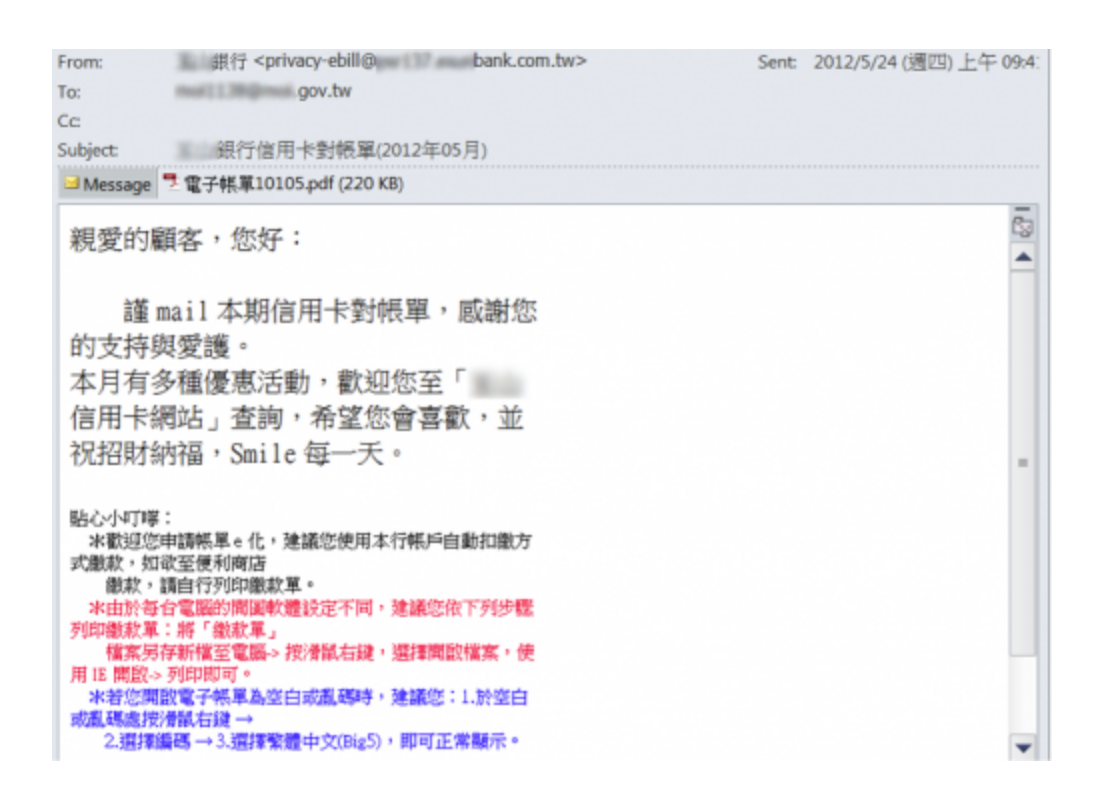
Figure 3 Spear Phishing Email sent to a ministry of Taiwan

Figure 3 shows an email which was sent to a ministry of Taiwan in May 2012.