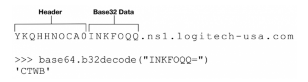
Figure 5 pisloader DNS beacon request

The pisloader sample will send a beacon periodically that is composed of a random 4-byte uppercase string that is used as the payload. An example of this can be found below: