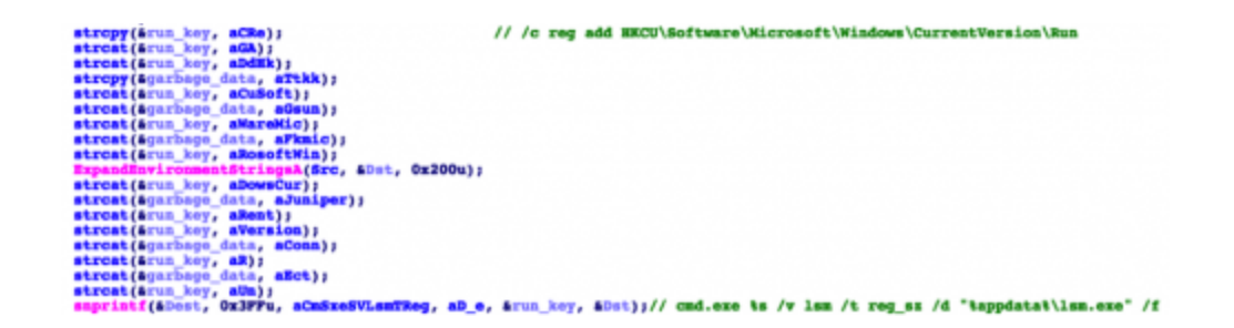
Figure 2 pisloader dropper building strings and setting persistence

In the above decompiled code, we see that the pisloader is generating the following string, which eventually is called to set the Run registry key.