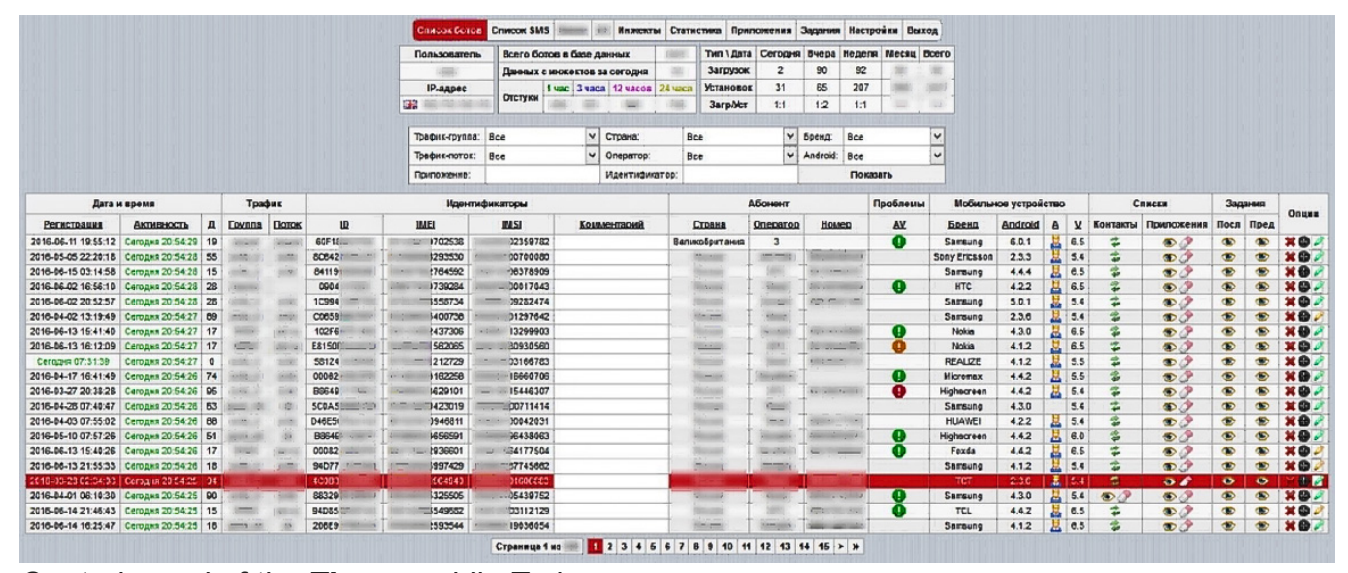
Control panel of the Tiny.z mobile Trojan

Group-IB specialists detected Tiny.z in early 2016. According to analysis of the botnet control panel, this is the same panel that was used by the well-known "404" criminal group that actively attacked clients of both Russian and foreign banks. Purportedly, after the arrest of a "404" member named Foxxx in 2015, Cron modified the malicious program.