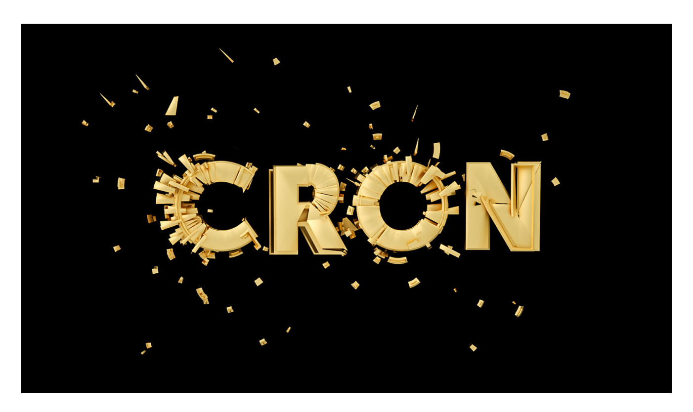
Group-IB supports operations to arrest gang for infecting 1 million smartphones

A black police vehicle, UAZ Patriot, is accelerating, chasing a cherry Renault Logan and forcing it to the roadside. The taxi driver in the Logan seems agitated, frightened even, accelerates quickly while shifting into higher gears. It has gotten dark; both cars speed close to the side of the road sweeping bushes. "Be ready to run," one of the officers warns his colleagues. "He's going to brake and flee over the fence." When the Logan finally stops, the officers act faster: with the entry team jumping out, pulling the passenger from the back seat and laying him face down in the snow.