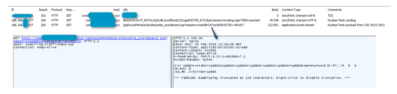
Figure 1 : Nuclear Pack dropping "Alphabot", first observed on February 15, 2016

The following analysis details what we have observed and uncovered so far.