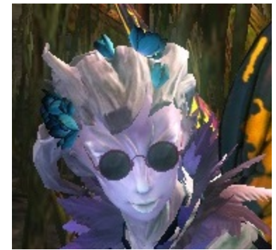
<u>ScathEnfys</u> - 6 years ago

I'm hoping that the reason the C2 is disabled for the moment is that they found some sort of flaw in the code... A flaw we may be able to use to decrypt the files without paying the ransom or at least study this interesting piece of malware more than the developers intended.