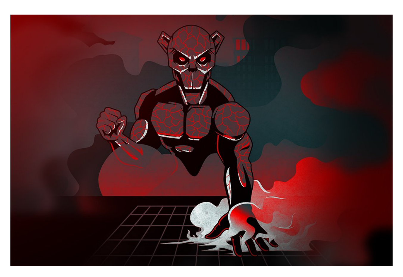
Who is EMBER BEAR?