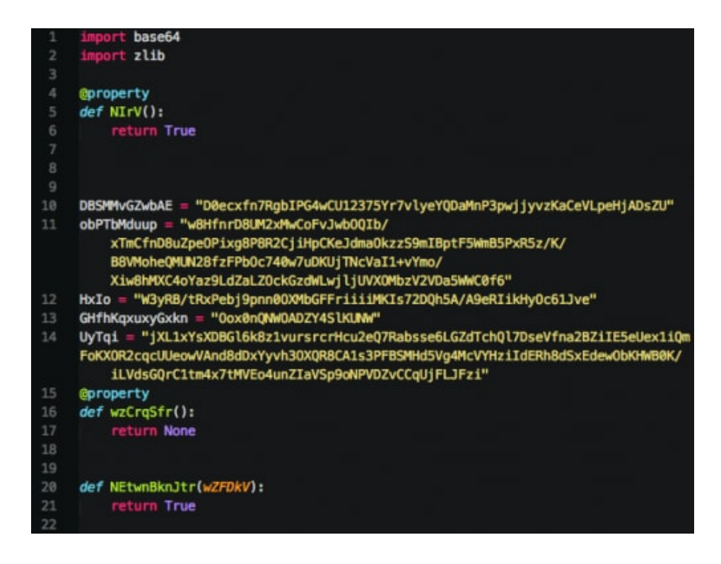
Figure 2. Obfuscated Python code