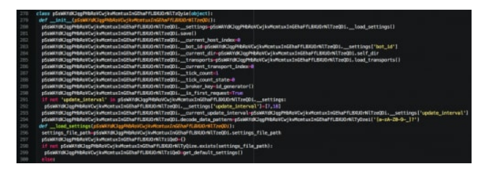
Figure 4. Obfuscation discovered in final payload

As we can see below, almost all variable names and class names have been obfuscated using long unique strings.