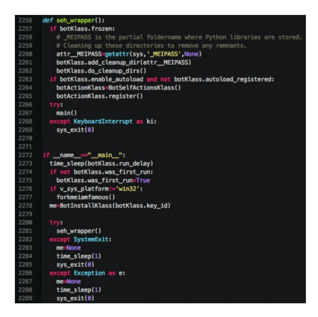
Figure 6. Main execution of malware

Continuing along, we discover that this malware has the ability to persist using one of the following techniques: