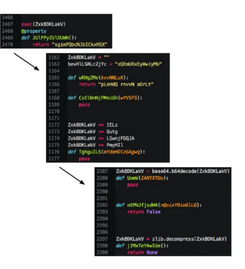
Figure 3. Second layer of obfuscation identified

The following simple Python code can be used to circumvent this layer of obfuscation: