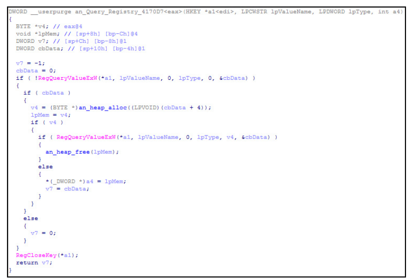
Figure 4. The function in Ice IX that reads data from registry

In the Ice IX sample, there are some changes in the places where the function is called. The API function RegOpenKeyEx was removed from the function that reads registry data: