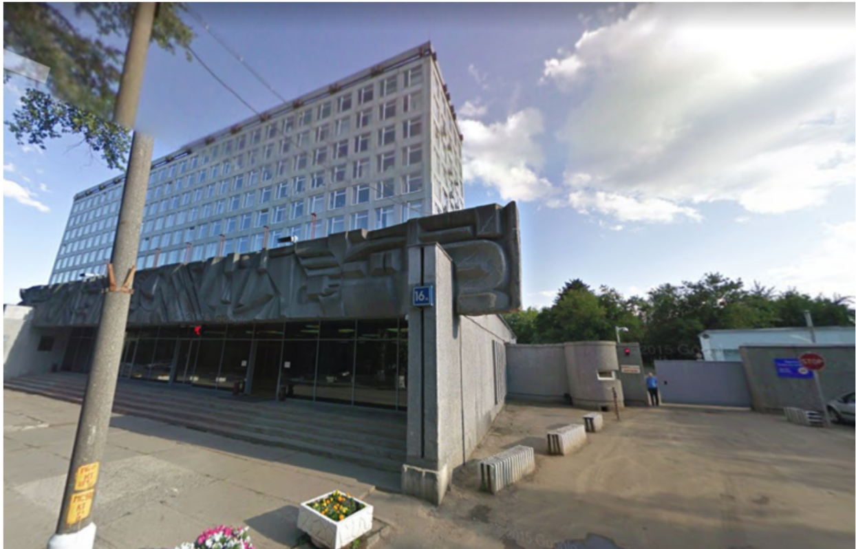
Figure 3: Central Research Institute of Chemistry and Mechanics (CNIHM)

CNIHM Likely Possesses Necessary Institutional Knowledge and Personnel to Create TRITON and Support TEMP.Veles Operations