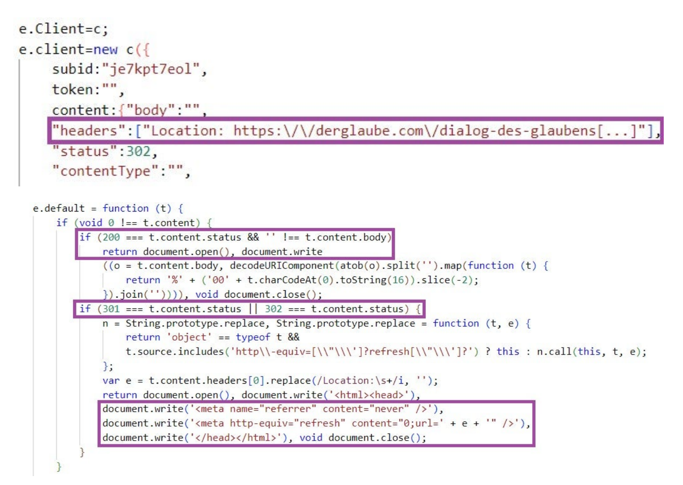
JavaScript code from sdgqaef[.]site

sdgqaef[.]site and ggspace[.]space host at the /admin URL path a login page, which has been <u>assessed</u> to be of the <u>Keitaro</u> Tracking System. Doppelgaenger possibly uses Keitaro to track the effectiveness of its campaigns.