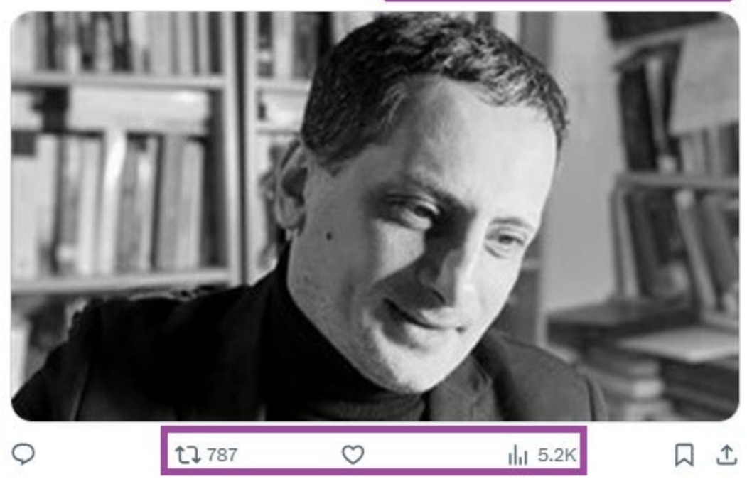
Engagement metric similarities

Pourquoi les pays de l'Est voient-ils dans la Russie un ami, tandis que nous la considérons comme un adversaire? t25nn2.bonus-menarik.xyz/b0r6y2