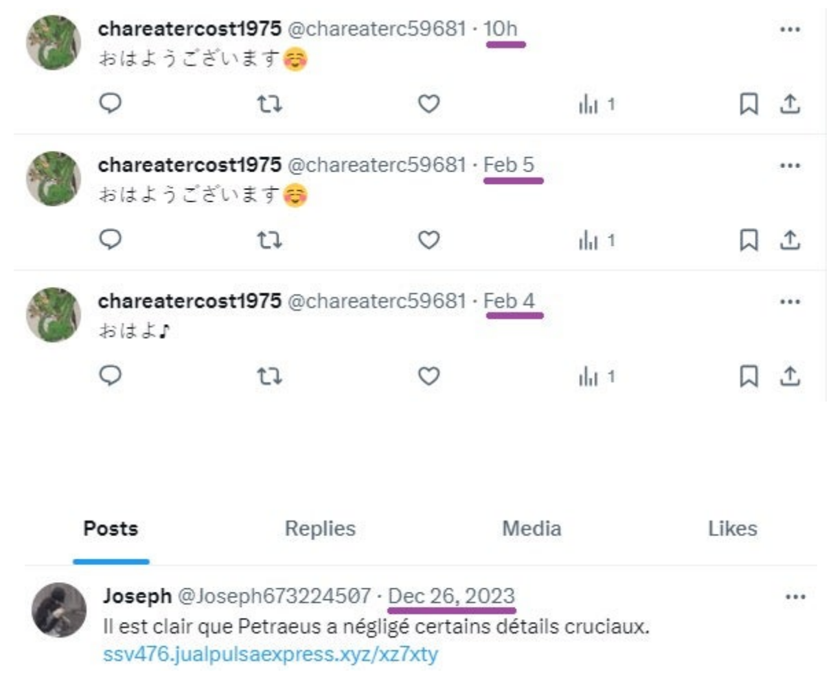
An active and idle suspected Doppelgänger account

Probably in an attempt to increase their visibility, some of the suspected Doppelgängermanaged X accounts we identified regularly post content, which does not necessarily contain first-stage websites, whereas others remain idle for relatively long time periods.