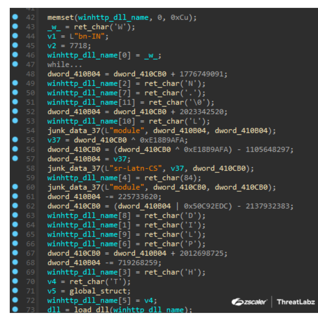
Figure 1. String stack construction