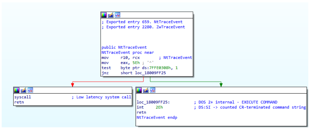
Figure 8: NtTraceEvent API code.