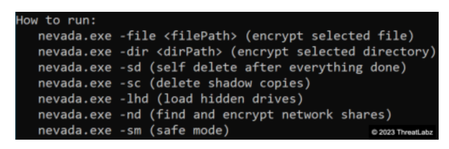
Figure 2. Nevada ransomware command-line help

In Nevada ransomware, the encryption parameters are hardcoded in the binary, but the other command-line options are virtually identical to Nokoyawa 1.1 and 2.0 (with the exception of a new feature to self-delete the ransomware binary after file encryption is complete). Nevada also supports a -help command-line argument, which prints the usage shown below in Figure 2.