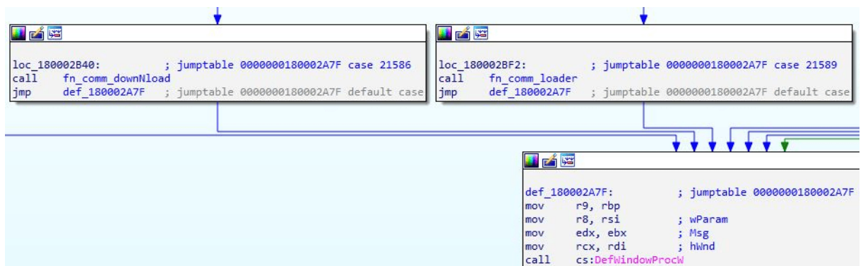
Figure 14. Added Windows messages

In comparison to the past versions, the method of communication with the C&C server for versions up to v2.2 used the “param” parameter, like the past versions. From v2.3, “jsessionid” is used for the parameter, and the RC4 key value is also different.