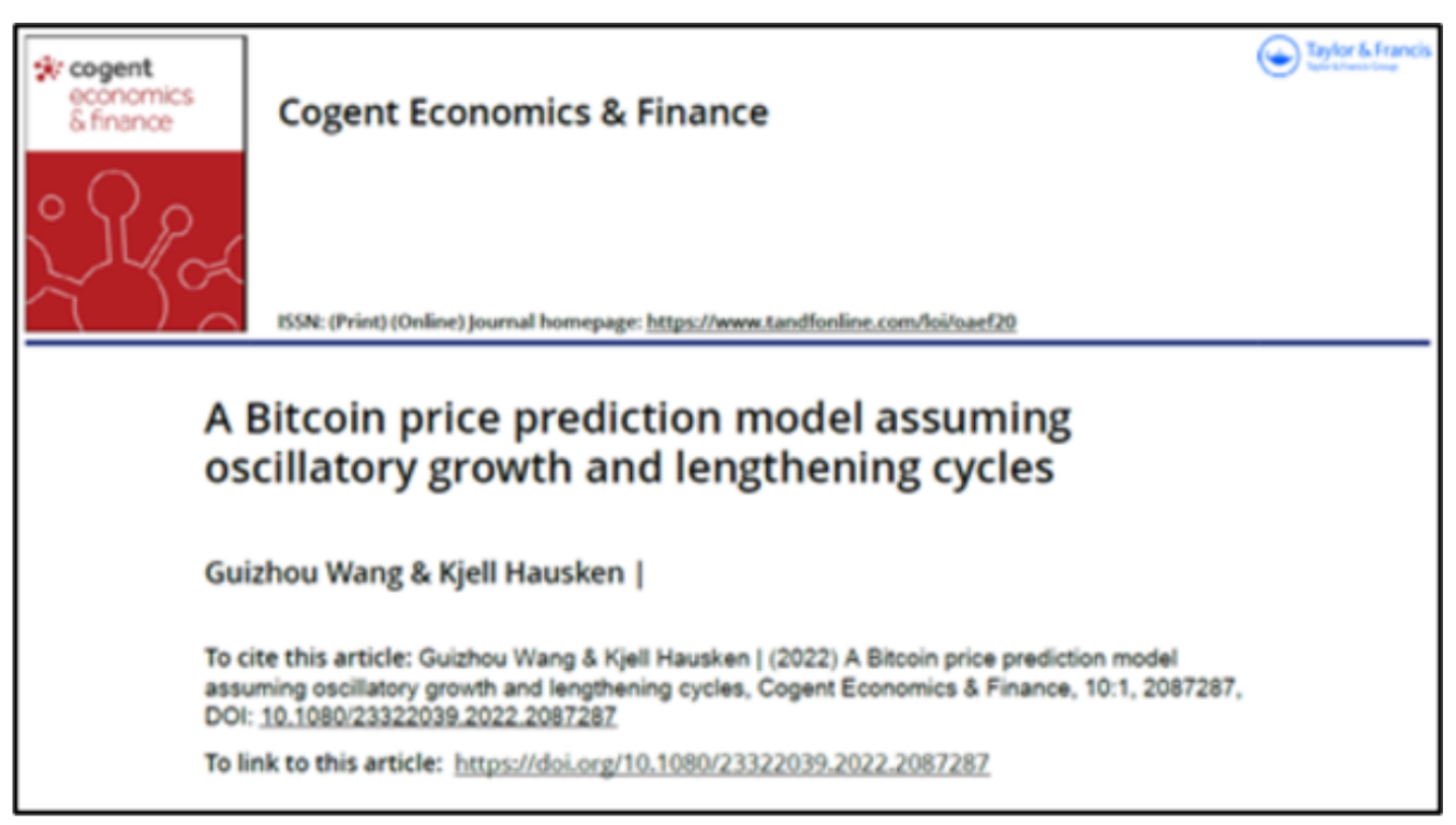
Figure 3: Bitcoin Bull Prediction.pdf, lure document

In late 2022, the group was identified leveraging several lure documents relating to cryptocurrency, as well as other financial entities including investment firms and banks. In addition to targeting crypto and leveraging lure material, the CryptoCore grouping of clusters has been observed masquerading as crypto institutions from around the globe.