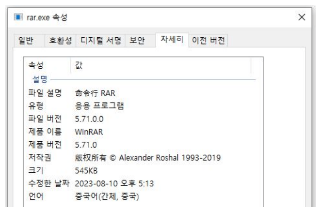
Figure 3. Chinese version of WinRAR.exe

In the process of maintaining persistence, the threat actor installs web shells using WinRAR. In some cases, the regular English version of WinRAR was used, but in attacks identified in 2019, instances of the Chinese version of WinRAR were found to be used.