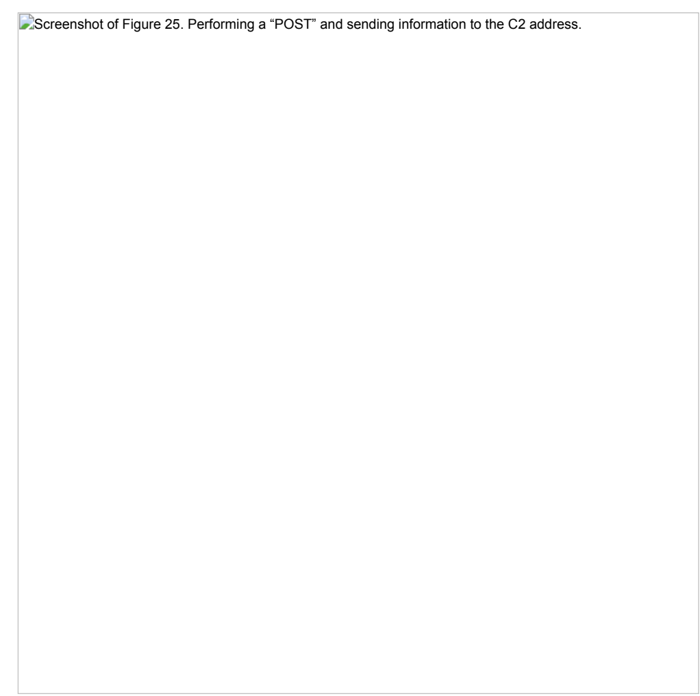
Figure 25. Performing a "POST" and sending information to the C2 address.

The actions performed by the RAT use a distinctive user-agent string, "cpp-httplib/0.7", making it stand out in traffic. It can communicate over TCP using raw sockets or via HTTP. The RAT can also perform other, less common HTTP verb-related operations, such as "PUT" and "PATCH".