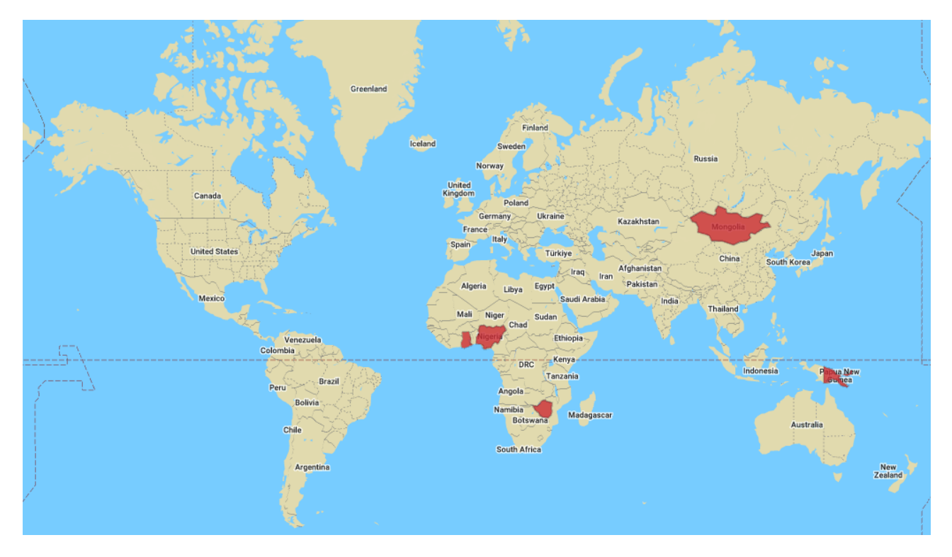
Figure 1: An unusual distribution of infections is the hallmark of a new PlugX variant that relies on DLL sideloading to propagate