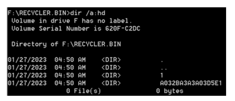
Figure 7: Once again, hidden files are revealed

Again, specific commands in the Windows command prompt reveal the real content of the RECYCLER.BIN directory: